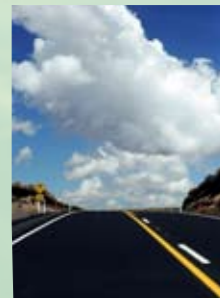
2 minutes drive to the SILK Highway