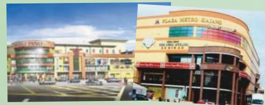
3 minutes drive to the town center.