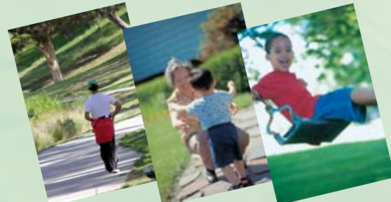
1 minute walk to the river side park